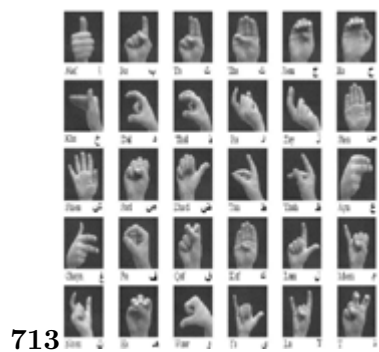
Figure 2: Figure 3 :